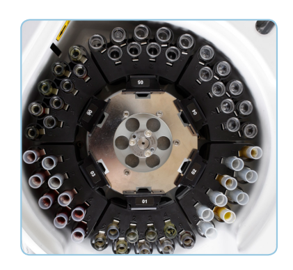
Sample disk for 54 samples: 9-pos. sample racks, max 6 racks. Any mix of sample cups and bar-coded primary tubes can be loaded at the same time.