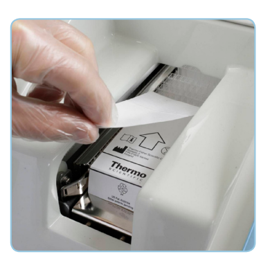
Cuvette loader for 360 cells. Low-volume reaction cuvette uses less reagent and water for lower environmental impact.