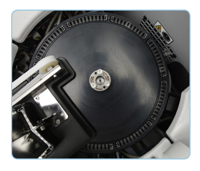
Temperature controlled incubator for 90 cuvette cells. Cuvettes are disposable, so there is no need for extra rinsing to prevent carry-over.