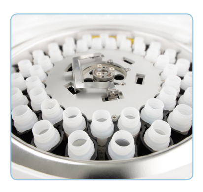
Reagent disk for 42 reagents. The reagent usage and expiry date are automatically monitored in real-time.