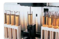
STAT port, STAT rack