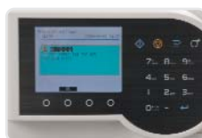
Big color display, keypad

The AUTION Max will change your lab routine for the better. No more time-consuming manual processing and result analysis. This system allows you to spend your valuable time efficiently, while you can trust on accurate and fast urine diagnostics.